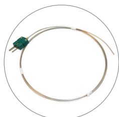
GC Column Probe

VKIT-1517 GC Inlet Probe has a Type K thermocouple mounted at the tip of 51mm needle. This allows temperature measurement of the inlet at precisely the position that the tip of a standard injection syringe would reach when injecting a sample. Most manufacturers split-splitless and packed inlets are compatible with this probe including Agilent, Shimadzu and PerkinElmer.