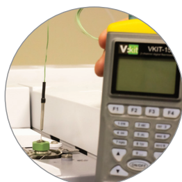
Measure GC inlet temperature with the VKIT-1517 inlet probe