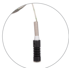
HPLC Autosampler Probe

V:Kit has developed a range of specialised thermocouple probes to simplify the task of making accurate and reliable measurements.