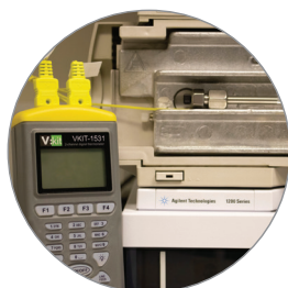
Measure column compartment temperature with the supplied VKIT-1516 probes